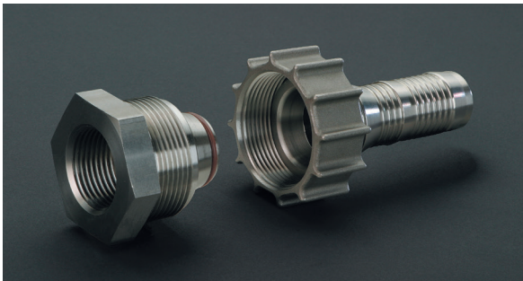
1" ChemJoint™ Coupling Set