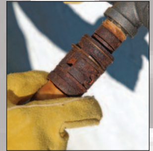
Steel locking sleeves rust and seize (above). Campbell's ZA sleeves don't!