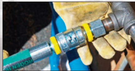
Use Campbell fittings with Nitrogen-Only Warning Rings on the hose and manifold to avoid deadly cross connections