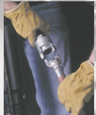
UniversaLock on jackhammer whip hose