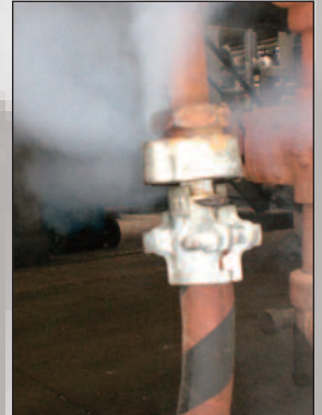
Leaking hoses are dangerous and costly